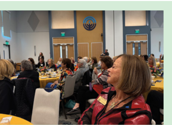
TribeTalk was a keynote speaker at a Jewish Federation women's leadership luncheon.

Across communities, a consistent message has emerged: young people are seeking spaces where complex conversations can be held with clarity, care, and structure. Educators report a growing need for practical tools that help students navigate identity, bias, and difficult current events without shutting down or turning away.