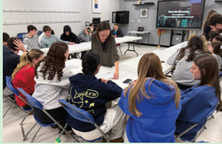
Students engage in a TribeTalk workshop exploring real-world situations involving antisemitism and identity.

Antisemitism today often appears in ways that are subtle, social, and embedded in everyday life. Many students have not yet encountered it directly, but when they do, it often comes unexpectedly and without preparation.