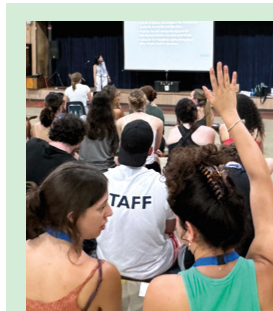
Summer camp counselors and teens engage with TribeTalk facilitators during an interactive workshop focused on real-world experiences.

When students are educated and prepared to recognize and respond to antisemitism, they feel empowered to engage with difficult moments. TribeTalk's programming builds confidence, language, and awareness, enabling students to take thoughtful action, support peers, and strengthen resilience within their communities.