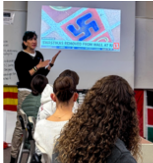
Among public school students trained in Park City, Utah in December, 2024: